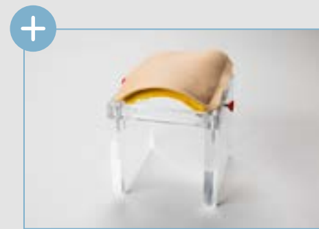
Portable chest tube model