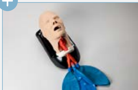
TruCorp AirSim Combo X