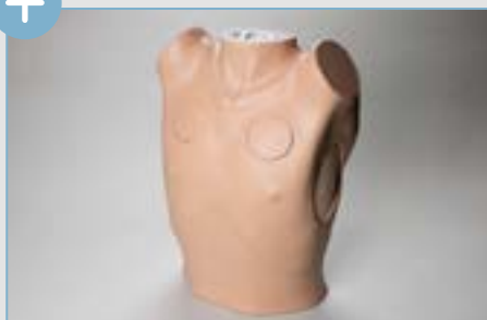
Limbs & Things' Chest Drain & Needle Decompression Trainer