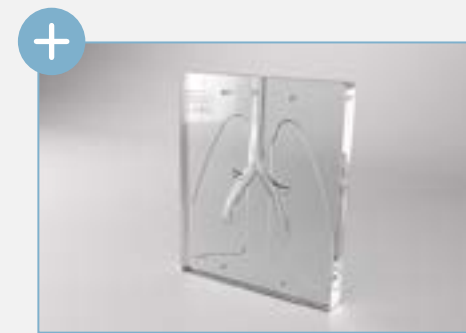
Acrylic lung model