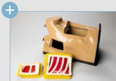
Sawbones Thoracostomy Model