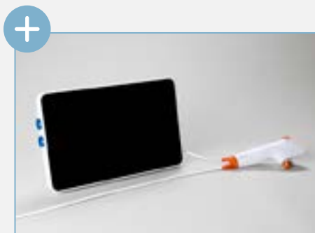
Ambu scope and monitor