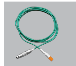
Probe Extension Cable