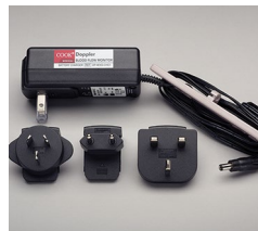
Monitor Battery Charger