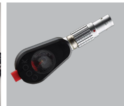
Doppler Channel/Cable Verifier

Some products may not be available in all markets. Contact your local Cook representative or Customer Support & Distribution for details. Please see product risk information in the IFU at cookmedical.eu .