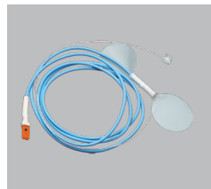
Cook-Swartz Doppler Probe