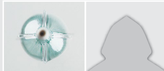
Single extrusion element

Intended for percutaneous transluminal angioplasty of lesions in peripheral arteries including iliac, renal, popliteal, infrapopliteal, femoral, and iliofemoral, as well as obstructive lesions of native or synthetic arteriovenous dialysis fistulas.