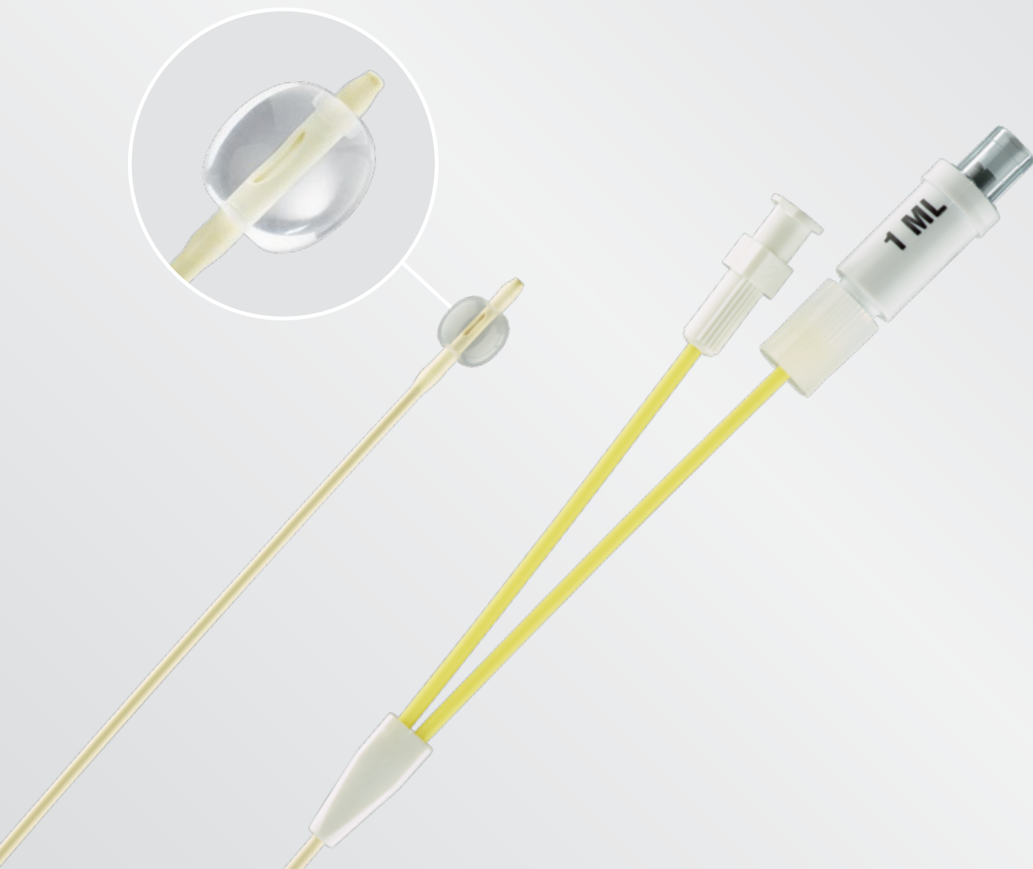
SILICONE BALLOON HSG CATHETER

Access and evaluate the uterine cavity and fallopian tubes.